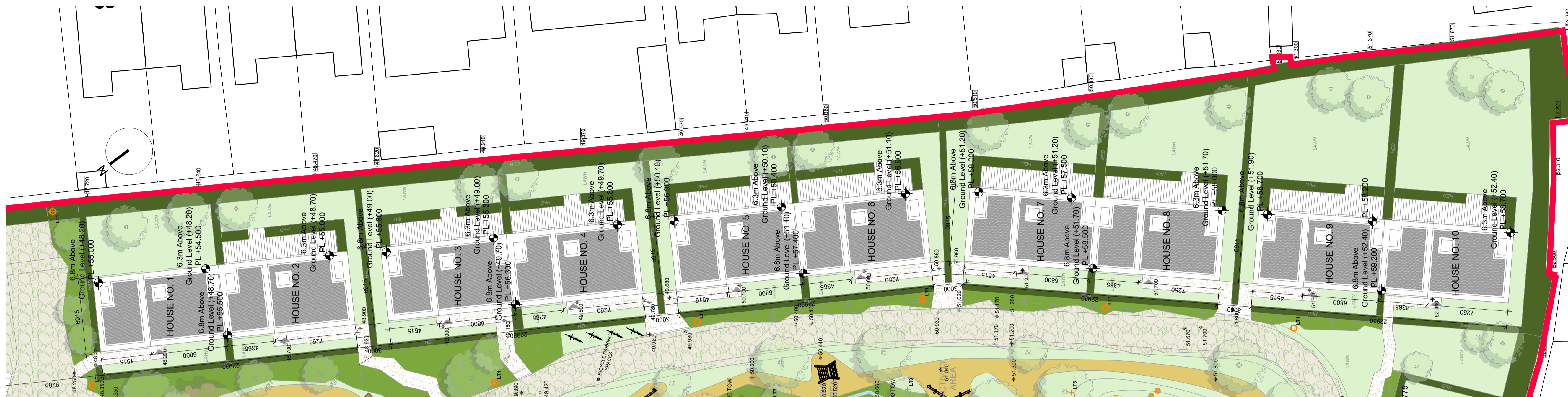
01 PROPOSED HOUSES ROOF PLAN SCALE 1:200