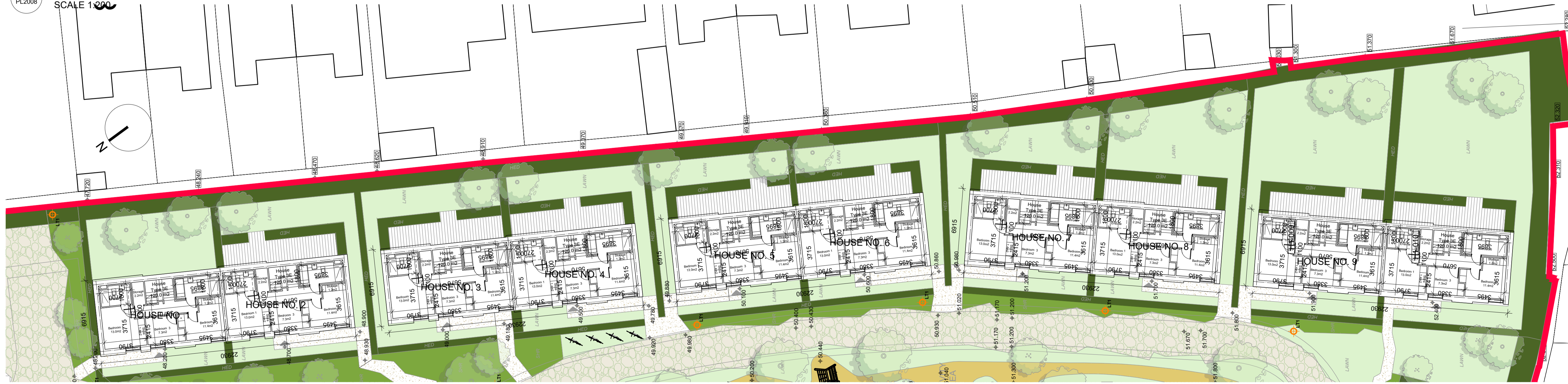
03 PROPOSED HOUSES FIRST FLOOR PLAN SCALE 1:200

NOTE: ALL DIMENSIONS TO BE CHECKED ON SITE NO DIMENSIONS TO BE SCALED FROM THIS DRAWING THIS DRAWING IS TO BE READ IN CONJUNCTION WITH RELEVANT CONSULTANTS DRAWINGS